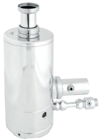
Roediger Maritime Sanitation – The reliable systems in stainless steel