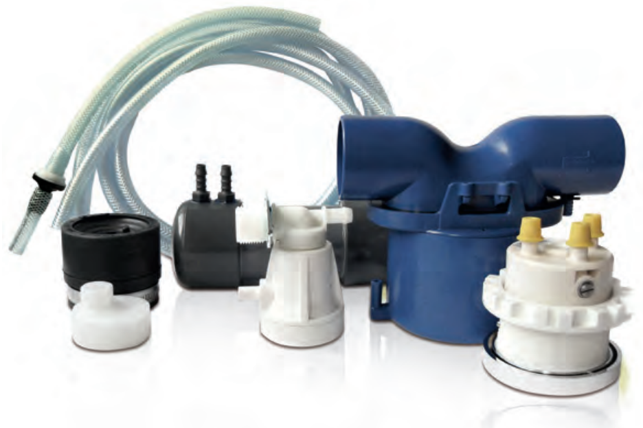
Roediger Retrofit Kits – the upgrade for all ships