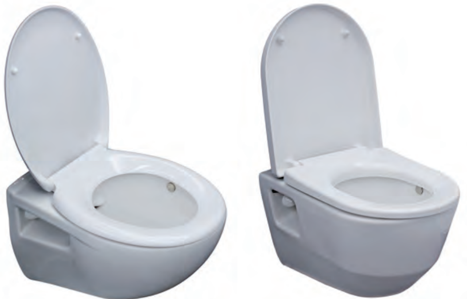
Roediger Vacuum Toilets and Evacuation Units for all applications